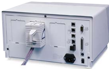
Kaye Validator back

USB port allows direct connection between PC and Validator for downloading studies.