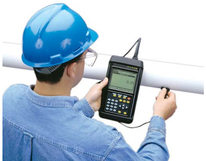
PT878 thickness-gauge option

Continuous operation to 100°F (37°C); intermittent operation to 500°F (260°C) for 10 sec followed by 2 min air cooling