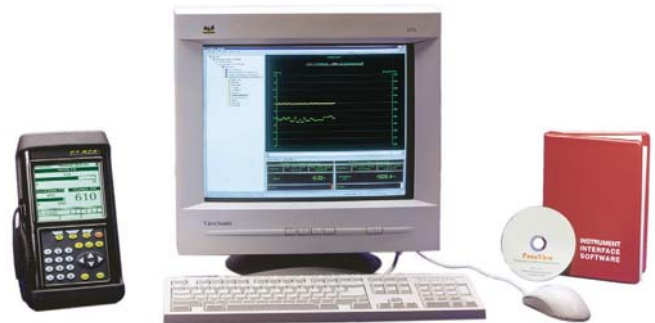
PanaView software links your TransPort flowmeter to your PC.

Infrared adapter plugs into any available serial port to give desktop PCs infrared capability.