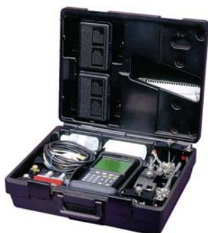
The complete TransPort PT878 flowmeter system fits in a compact carrying case.

When you need a permanent record of your work, live measurements, logged data and site parameters can be sent to a variety of printers by beaming data directly from the TransPort PT878's infrared port. A compact, lightweight, hand-held, infrared thermal printer is available. This printer is powered by a lithium ion battery.