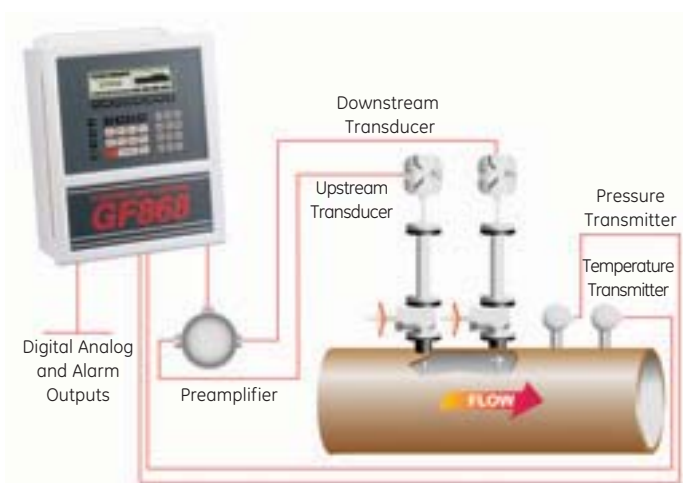
Typical meter set-up for standard volumetric or steam mass flow.

Ultrasonic flow measurement, the ideal technology for flare gas applications, is independent of gas properties, and does not interfere with the flow in any way. All-metal ultrasonic transducers installed in the pipe send sound pulses upstream and downstream through the gas. From the difference in these transit times between the transducers, with and against the flow, the DigitalFlow GF868's onboard computer uses advanced signal processing and correlation detection to calculate velocity, and volumetric and mass flow rate. Temperature and pressure inputs enable the meter to calculate standard volumetric flow. For maximum accuracy, use the two-channel version and measure along