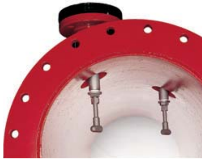
Inside view of a Bias 90 flare gas installation

Transducers and flowcells for specific applications are available. Consult GE for details.