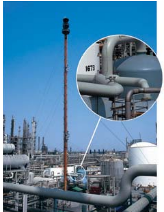
DigitalFlow GF868 field installation on a typical flare system. Insert shows transducers installed on the flare header that leads to the flare stack.