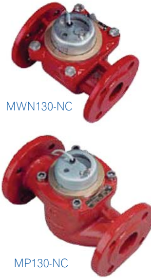
Tabela 15. BASIC TECHNICAL CHARACTERISTICS