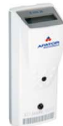
Tabela 17. BASIC TECHNICAL CHARACTERISTICS

Designed for counting the costs of room heating with heating systems. The recommended range of usage in vertical or horizontal heating system with one or two pipes with the average minimal temperature of the heat carrier \geq 35^{\circ}\text{C} and max \leq 90^{\circ}\text{C} .