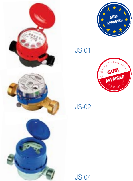
Tabela 1. BASIC TECHNICAL CHARACTERISTICS