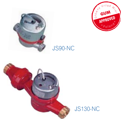
Tabela 13. BASIC TECHNICAL CHARACTERISTICS