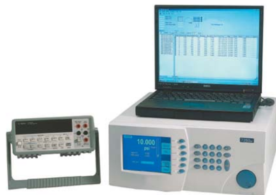
The Series 7250 can be used with Intecal software to perform fully automated calibrations. Intecal includes drivers for popular DMMs, multiplexers and environmental chambers, allowing a variety of configurations and options for maximum flexibility and capability. Please refer to the Intecal datasheet for additional information.

Computer interface —every Series 7250 is provided with both an RS232 and IEEE-488 interface, and Series 7250 syntax follows SCPI protocol for easy programming. Intecal, an off-the-shelf software package is available in addition to the LabVIEW® driver, a free download and optional MET/CAL® driver. As a standard feature, software written for GE's previous generation Series 7215, 7010 and 6000 instruments is fully supported by the Series 7250. The Series 7250 can also be set to 510 emulation mode to use software originally written for the DPI 515. Firmware updates can also be performed over the RS232 interface (updates can be downloaded from the web site).