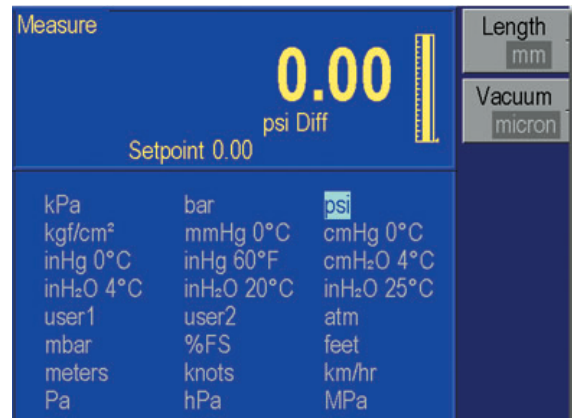
The Series 7250 features an easy-to-navigate menu structure with full text descriptions for menus and commands. The large color display allows the pressure value to be displayed even when viewing a submenu selection such as the units selection screen shown above.

The Series 7250 high speed digital pressure controllers can easily automate your test and calibration workload. All are easy to use, easy to maintain, and have the reliability, performance and features that you want.